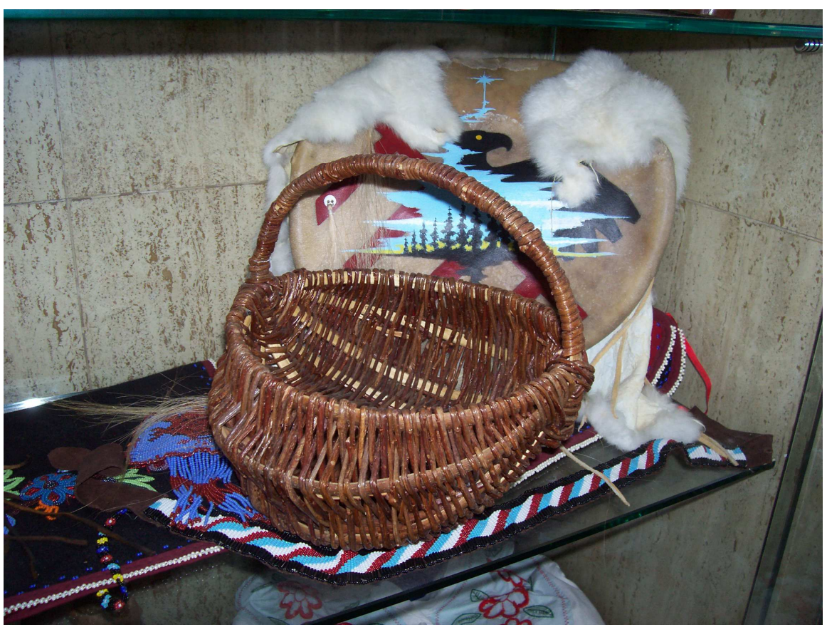
Red willow basket made by the Cree family at Turtle Mountain, North Dakota (Louis Riel Institute Collection).

The frames of the baskets are constructed of ash wood. The red willow shoots are picked from the new growth in the spring and kept pliable by soaking in water, or are kept frozen until they are to be used. The white wood pieces in the design are created by skinning the bark from the red willow.