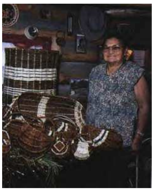
A wide variety of baskets.